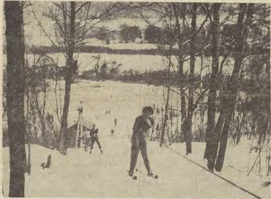
Going up the ski trail at Jug End Barn, South Egremont, Mass., site of intersession weekend.