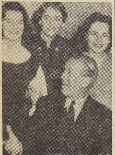
Maurice Chevalier chatting with admirers at the Maison Francaise.

That irrepressible 68-year-old Frenchman, Maurice Chevalier, delivered an improvised story of his career yesterday at Columbia's Maison Francaise.